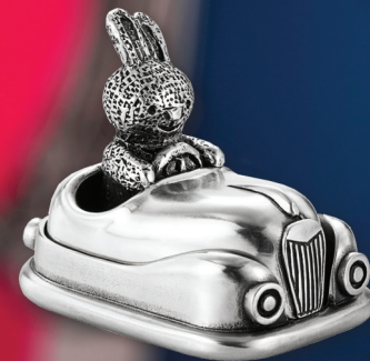
8. DODGEM TOOTH BOX £29