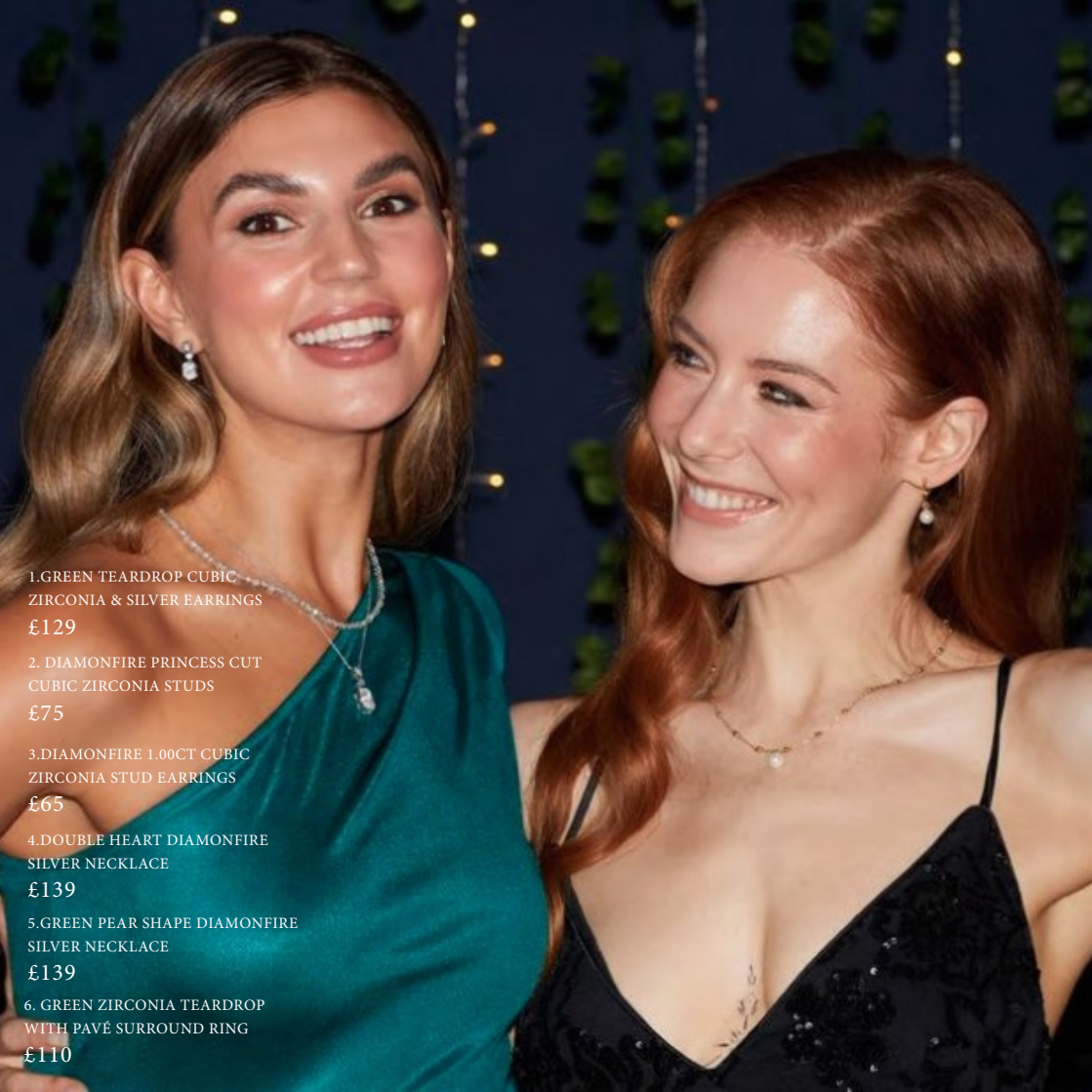
1. GREEN TEARDROP CUBIC ZIRCONIA & SILVER EARRINGS £129