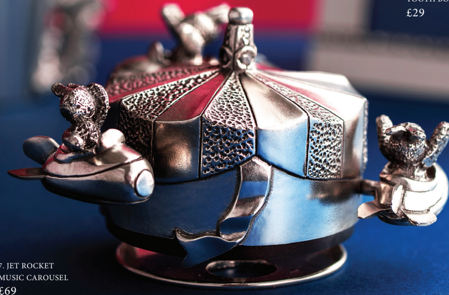
7. JET ROCKET MUSIC CAROUSEL £69