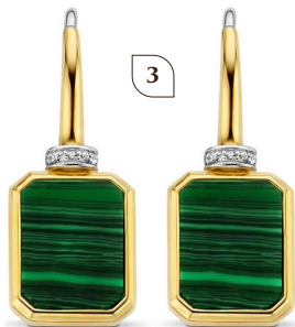
4. MALACHITE RECTANGULAR SILVER GOLD PLATE NECKLACE £149