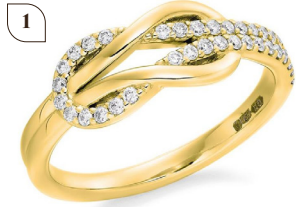
1. 0.25CT DIAMOND INFINITY LINK RING £1495

* PLEASE NOTE CHAINS ARE NOT INCLUDED IN PENDANT PRICES QUOTED