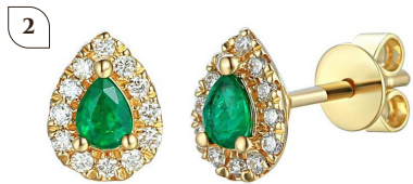
2. PEAR SHAPED EMERALD & DIAMOND STUD EARRINGS £895