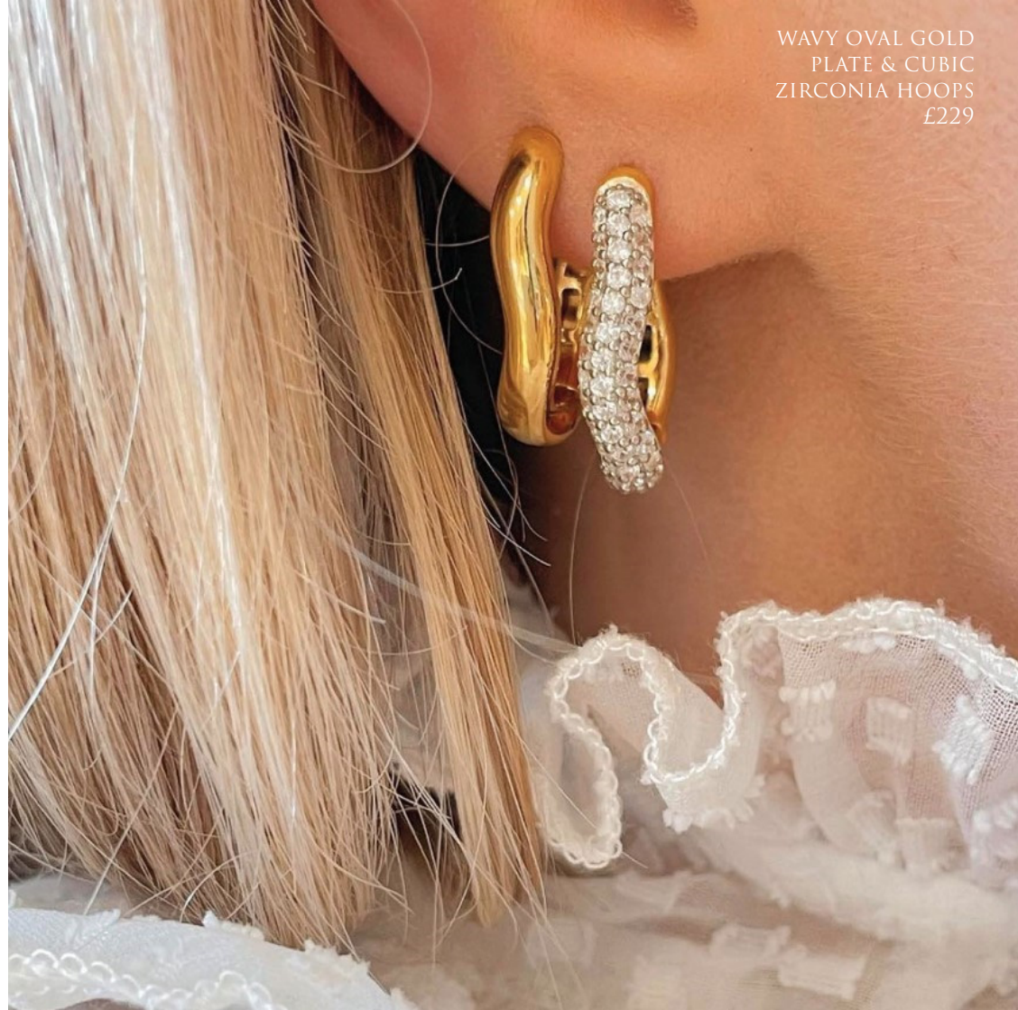
WAVY OVAL GOLD PLATE & CUBIC ZIRCONIA HOOPS £229