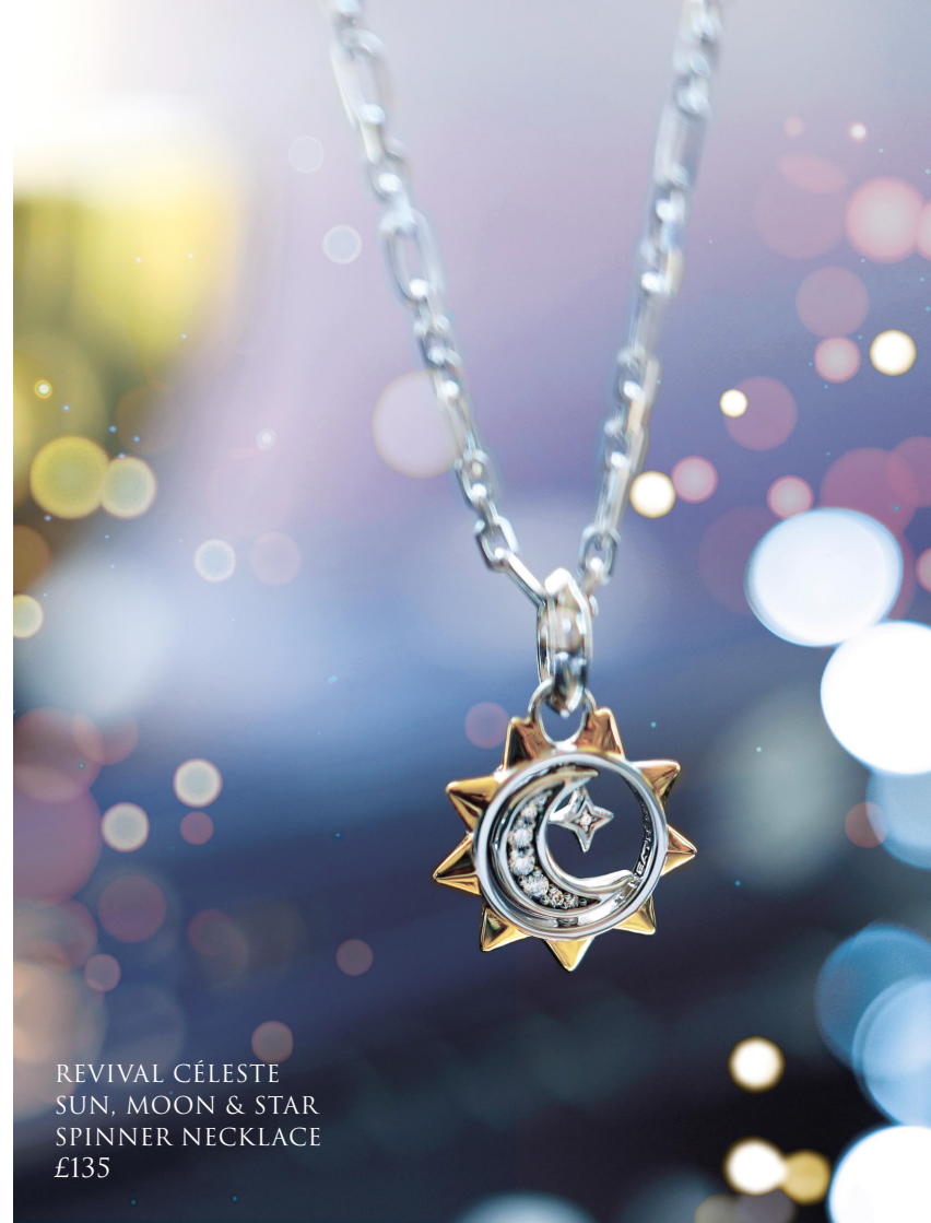
REVIVAL CÉLESTE SUN, MOON & STAR SPINNER NECKLACE £135