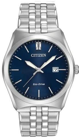
1. CITIZEN GENTS ECO-DRIVE WATCH

Citizen's diverse portfolio of high-performance and eco-minded watches range from professional-grade, sport-inspired designs with advanced functions to sophisticated, timeless silhouettes that are beautiful as well as collectible.