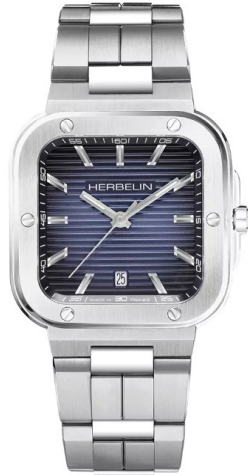
3. HERBELIN MEN'S CAP CAMARAT

The Cap Camarat collection is growing with this new shape of case. Made of stainless steel, the case is square with rounded corners. Original and modern, this watch will dress with elegance the male wrists. £539