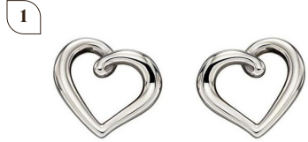
1. ORGANIC HEART 9CT WHITE GOLD STUD EARRINGS £199

* PLEASE NOTE CHAINS ARE NOT INCLUDED IN PENDANT PRICES QUOTED