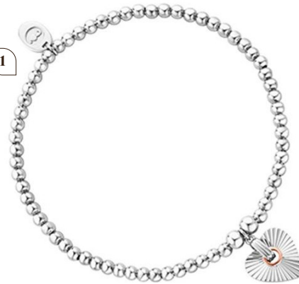
1. CARIAD HORIZON AFFINITY BEADED SILVER BRACELET £139