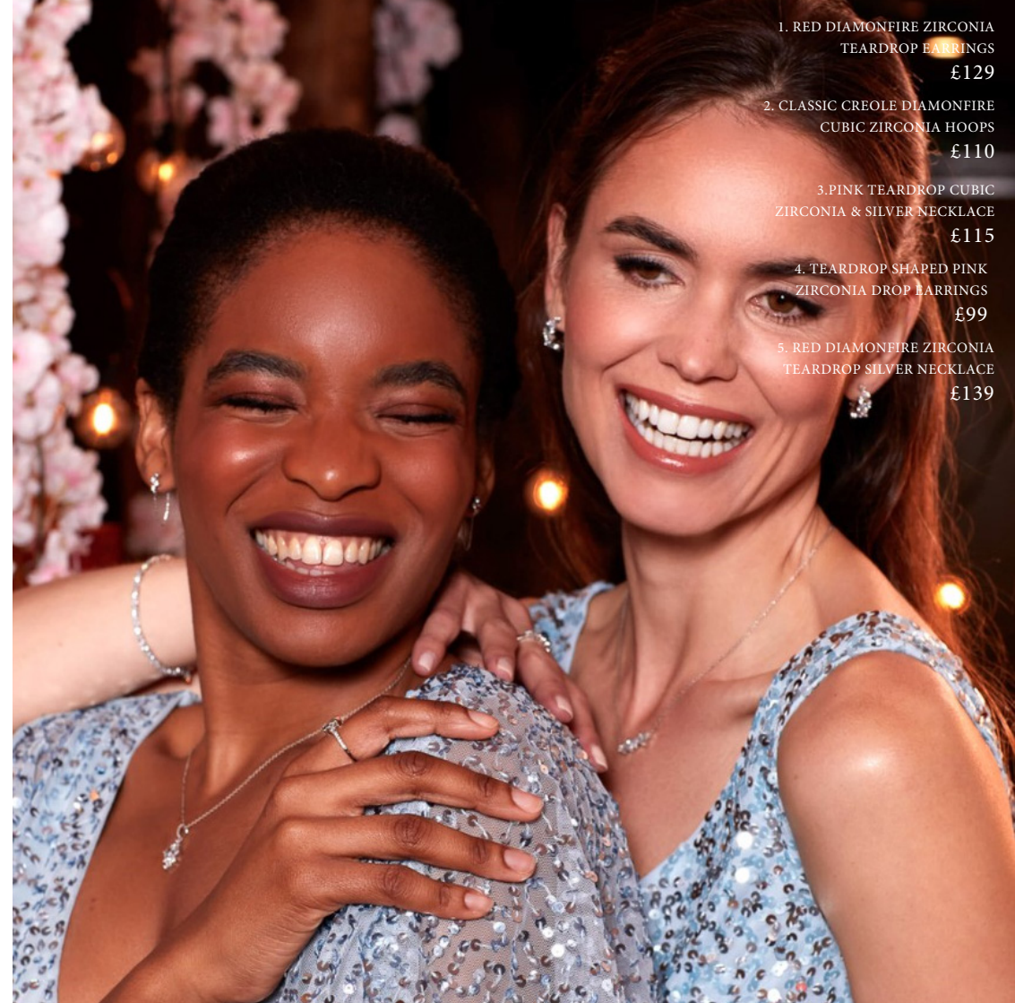
1. RED DIAMONFIRE ZIRCONIA TEARDROP EARRINGS