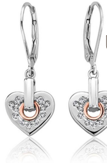
5. CARIAD SPARKLE SILVER & WELSH GOLD DROP EARRINGS £179