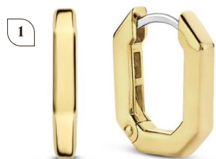
1. TI SENTO GOLD PLATED HUGGIE HOOPS £129

Handset stones and Italian inspired designs create a seamless and sophisticated luxury to this collection. Made with 925 sterling silver and rhodium plated for lasting radiance and protection. Accents of yellow and rose gold plating allow you to mix and match your favourite designs.