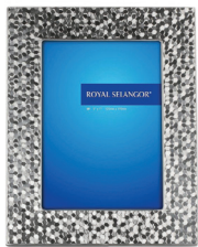
1. HONEYCOMB 5R PICTURE FRAME 24 X 18.5CM £59