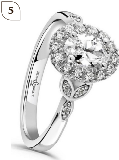
5. PLATINUM DIAMOND TRIO CLUSTER RING £4250