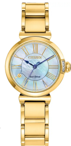
6. LADIES CITIZEN ECO-DRIVE WATCH

Classic lines and hints of romance make this newest piece to our ladies' collection, the Citizen L Mae, a glamorous addition of sustainable luxury. With a case design inspired by a vintage perfume bottle and featuring the curved, sleek lines of May bells. £429