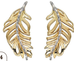
4. 9CT YELLOW AND WHITE GOLD FEATHER STUD EARRINGS £135