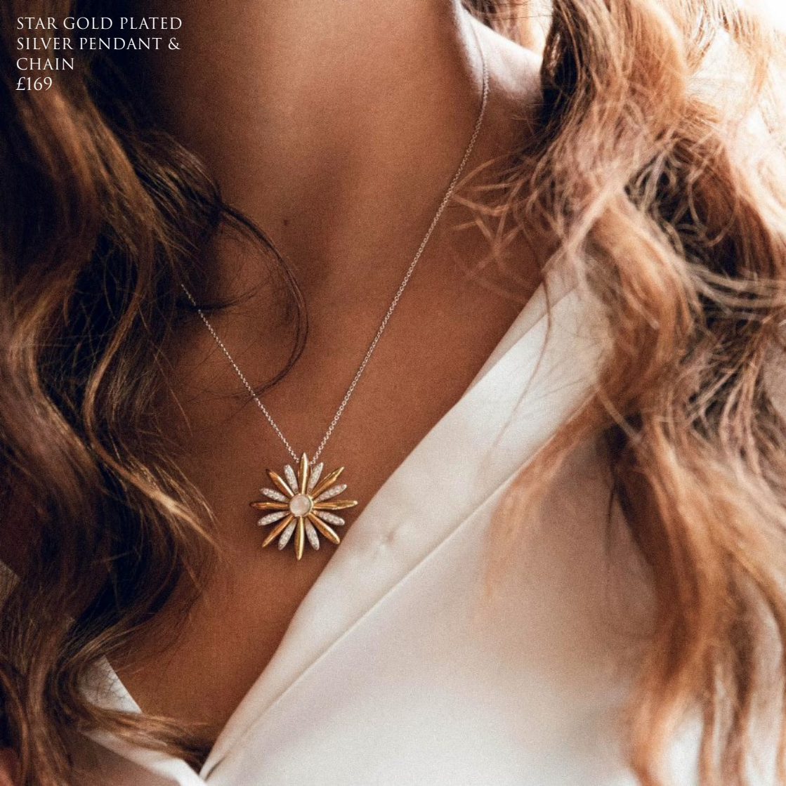
STAR GOLD PLATED SILVER PENDANT & CHAIN £169