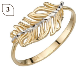
3. 9CT YELLOW AND WHITE GOLD FEATHER DESIGN RING £145