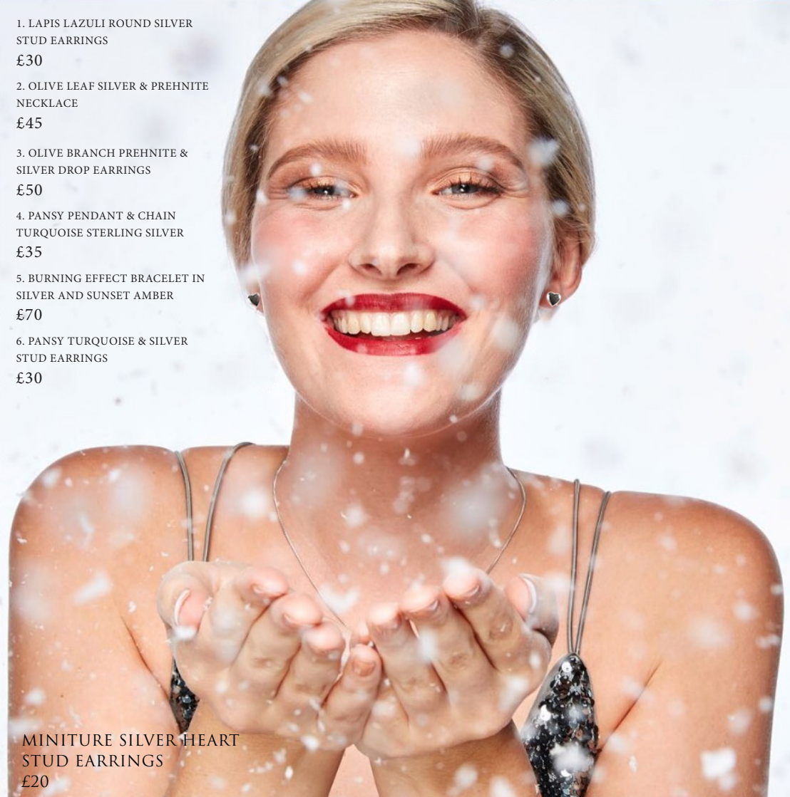
1. LAPIS LAZULI ROUND SILVER STUD EARRINGS £30