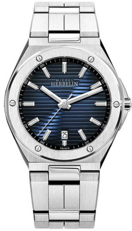
1. HERBELIN MEN'S NEWPORT WATCH

Herbelin carries on the finest watchmaking traditions in their French workshop, using the latest technology with skills honed over the generations. Every Herbelin creation is a unique piece featuring the very best swiss movements and the painstaking work of their master craftsmen.