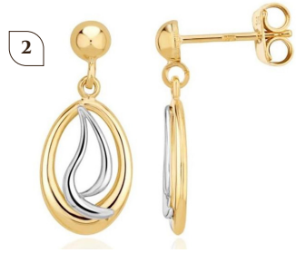
2. OVAL SQUIGGLE TWO TONE 9CT DROP EARRINGS £115