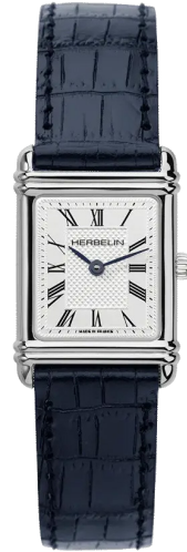
4. HERBELIN WOMEN ART DECO WATCH

The Cap Camarat collection is growing with this new shape of case. Made of stainless steel, the case is square with rounded corners. Original and modern, this watch will dress with elegance the male wrists. £539