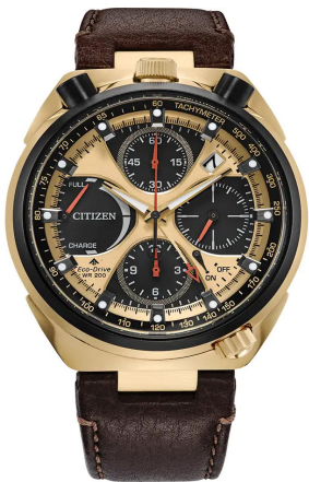
3. CITIZEN GENTS ECO-DRIVE LEATHER STRAP

The Limited Edition Promaster Bullhead Racing Chronograph is a high-performance timepiece with an undeniably distinct design that will stand out on your wrist. Inspired by the original Citizen Bullhead from 1973, the watch features a two-tone stainless-steel case secured by a sleek brown leather strap. £895