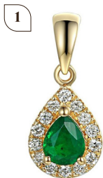
1. PEAR SHAPED EMERALD & DIAMOND CLUSTER PENDANT £745

* PLEASE NOTE CHAINS ARE NOT INCLUDED IN PENDANT PRICES QUOTED