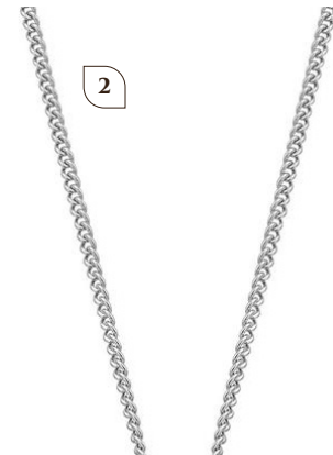
2. WELSH BEACHCOMBER SILVER PEARL PENDANT £149