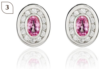
3. OVAL PINK SAPPHIRE & DIAMOND CLUSTER 9CT EARRINGS £545