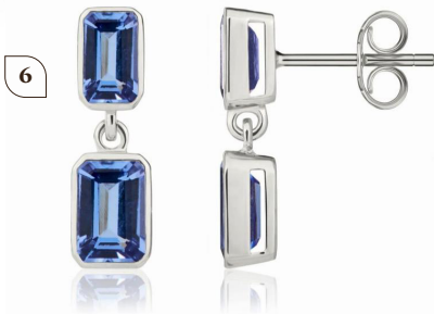
6. TANZANITE 9CT WHITE GOLD OCTAGONAL DROP EARRINGS £625