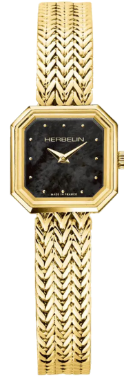
6. HERBELIN WOMEN CLASSIC WATCH

Octagon is the elegant collection with a minimalist look. The bracelet woven with a fine mesh in yellow gold PVD adds a touch of sparkle to this watch. The genuine black mother-of-pearl dial is delicately flanked by dauphine hands. The Herbelin watchmaking workshop signs all its collections in Charquemont. £518