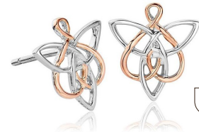
6. FAIRIES OF THE MINE STUD EARRINGS £109