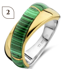
2. TI SENTO MALACHITE CROSSOVER GOLD PLATED RING £199