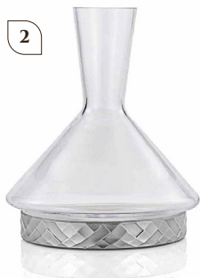
2. FROST PEWTER & GLASS DECANTER £229