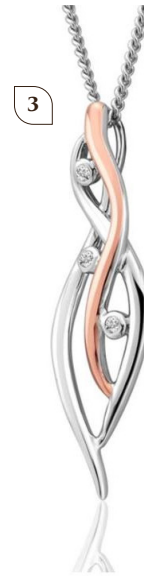
3. SWALLOW FALLS PENDANT NECKLACE £209