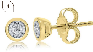
4. 0.10CT DIAMOND ILLUSION SET 9CT GOLD STUD EARRINGS £275